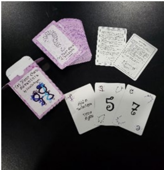
Figure 6 Tat Your Own Adventure Card Deck, $25, one deck of 72 cards in a tuck box