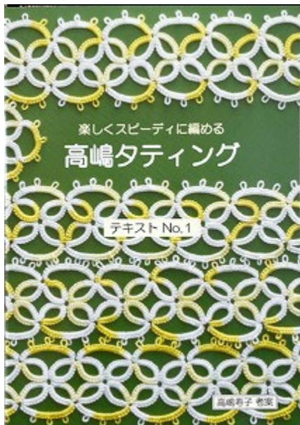
Figure 2 Text book 1, $5, consists of the patterns with ring and crochet, 16 pages.