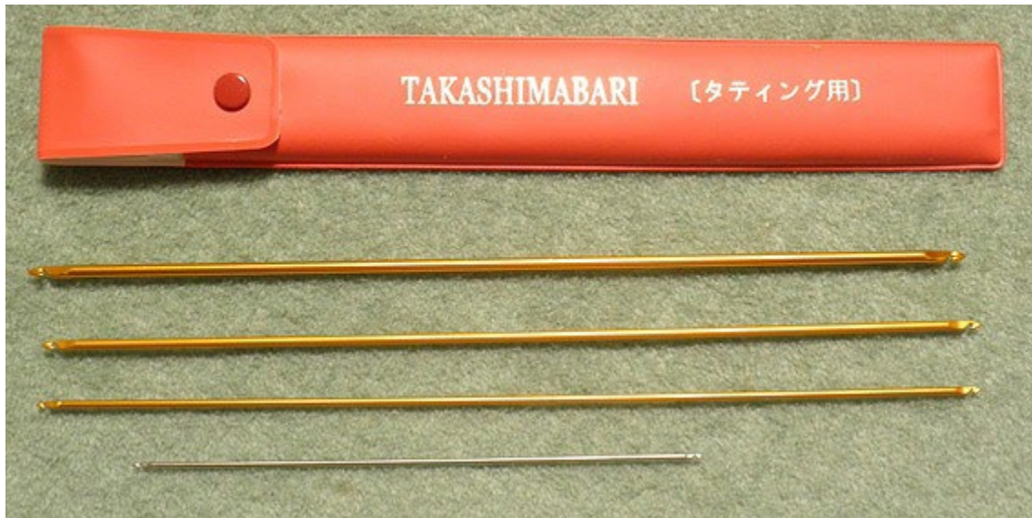
Figure 1 Takashima Tatting Hook, $35, (4 different size hooks) includes printing of "How to make ring & chain" in English