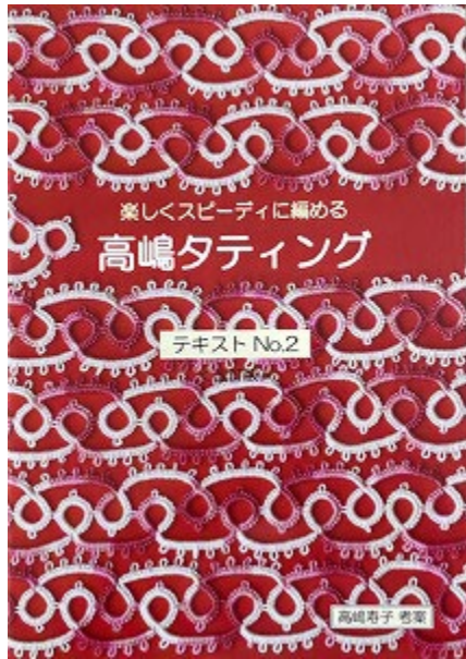
Figure 3 Text book 2, $5, consists of patterns with ring and chain, 16 pages.