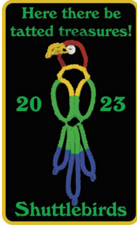
Workshop Embroidered Patch, $7.50 *Image is digital mock-up not final product